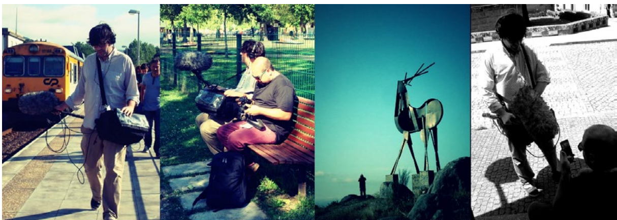
Figure 1. On site sound recording in Vila Nova de Cerveira.

Finally, in each city, a series of geo referenced field recordings of the identified sonically interesting locations within the urban space and also surrounding landmarks were made.