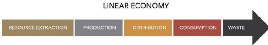
Figure 1. Resource flow in a linear economy

The inevitable result of low-cost materials and high-cost labour is a widespread disregard for recycling, reusing, and placing a high value on waste. According to the Ellen MacArthur Foundation (2013), regulatory, accounting, and fiscal rules have been supportive of this system. The lack of protocols for charging negative externalities means that producers have less incentive to examine the external costs of their operations.