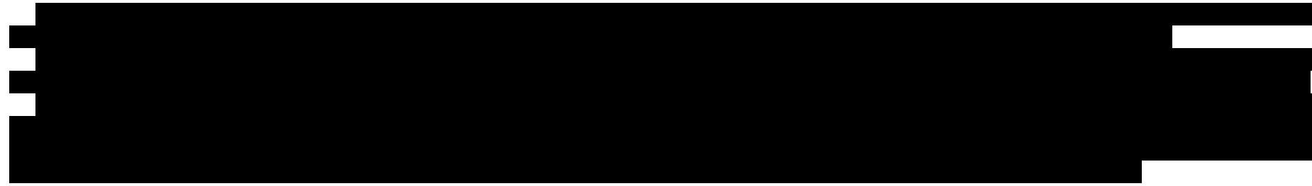
Process PT Veolia Indonesia (RECYC289) based on the Polymetrix technology